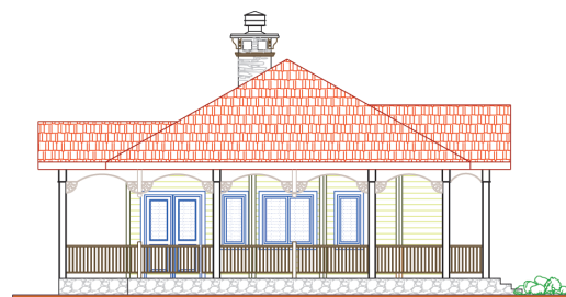
FRONT RIGHT SIDE